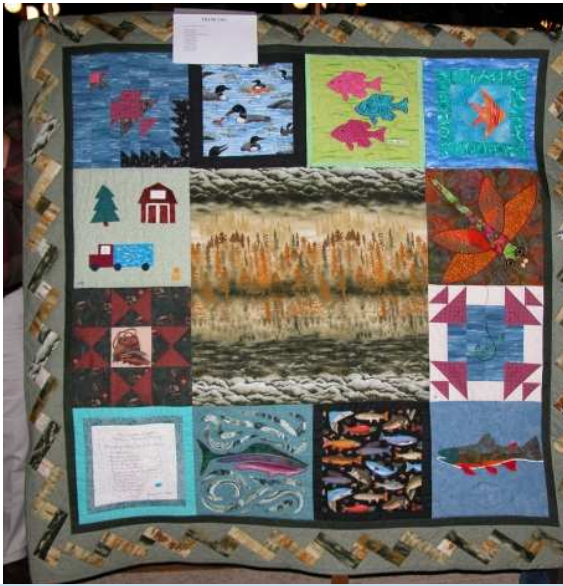
The creativity of some Chapter members was highlighted in this unique fish quilt made up of donated squares from around the State.