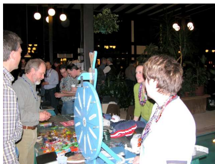
Waiting to see who will get lucky at the 2006 Annual Meeting

I believe the annual meeting was a success. It was great to see all natural resource professionals from throughout the state get together. For MN AFS this was a very well attended meeting and I trust that most of you enjoyed the presentations. The planning group did try and get a diverse group of speakers centered on the theme of sustainable resource management. Last June we started out with the potential theme "Natural Resource Management: Beyond Monitoring the Decline" but that did seem kind of negative. Weekly, I see references to many of the themes presented by the various plenary speakers whether it is climate change issues, the interactions of energy policy and NR management and the changing face of the ownership of our forests and other public lands. There is no doubt that the fisheries and natural resource management landscape is always changing. Hopefully, this past annual meeting will