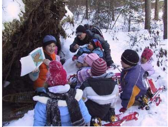
Reading a story by a wind blown white spruce

How often do you reflect about the future of your profession – forestry, wildlife, fisheries, ecology, or another similar field – and think about what drew you to it? Do you think about what you did, or didn't do, as a child or young person, and how those experiences led you to academic studies and to your current job? Do you think about what youngsters are doing, or not doing, these days and how you might provide an experience they are not getting? And have you also thought, "I'm no teacher! I just know (trees, plants, animals, insects, etc)." Or maybe, "This isn't part of my job responsibility!"