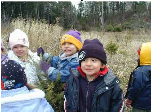
Checking out the planting

I look at traditional classroom and teacher resources for ideas, but in truth, I'm not interested in teaching in a classroom, if I can do the same thing outdoors, because kids, and grownups, spend far too little time outside as it is. If they leave the Cloquet Forestry Center tired, maybe wet, a little bit dirty, with a few spots of sap on their clothes and ruddy cheeks, with stories of bug holes in trees, animal tracks in the snow, snowshoeing on a frozen stream to find a beaver lodge, reading a story next to the roots of an upturned tree, and watching branches sway in the wind, we've had a successful day.