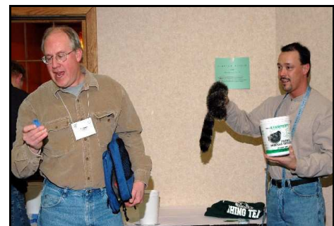
Faux coon cap up for grabs at the 2004 meeting

What if you could help out the Minnesota Chapter without doing much work? Sound good? Well then get looking through your stash of old banquet prizes, books, birthday gifts, impulsive purchases, and/or winter craft projects and donate something to the chapter fundraiser! Give that print in the closet a new home; show off your latest carving, quilt, fishing rod, or raccoon hat; send that knick-knack that you never took out of the box to a better place. If it is "like new" and might be desirable to someone (we will have a diverse audience this year at the joint meeting), let Brian ( brianborkholder@fdlrez.com , 218-878-8004) or Tom ( tom.burri@dnr.state.mn.us , 218-286-5220) know and bring your donation to the Annual Meeting in February.